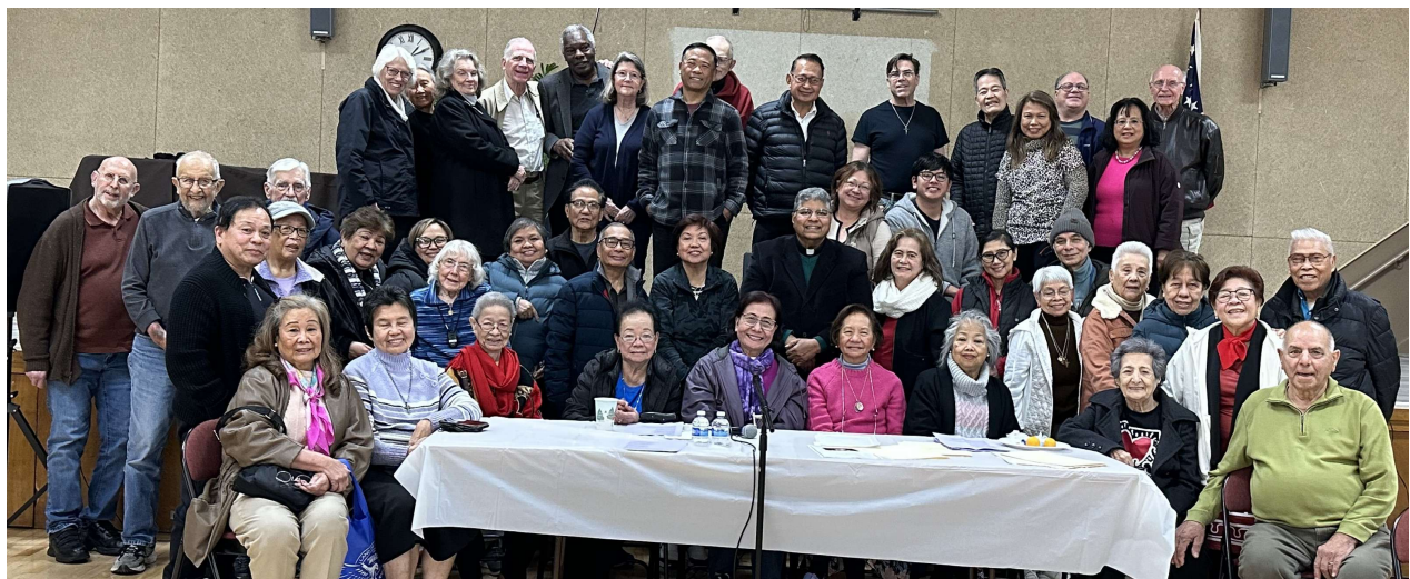
Advent Retreat December 6, 2025

Private Retreats: Vallombrosa Center currently offers private retreats for those who want private rooms for alone time, with spiritual direction available. Guests can enjoy the walking trails, shrines and gardens. There are both day retreats and overnight (no food or coffee service available in either case) – learn more and book above.